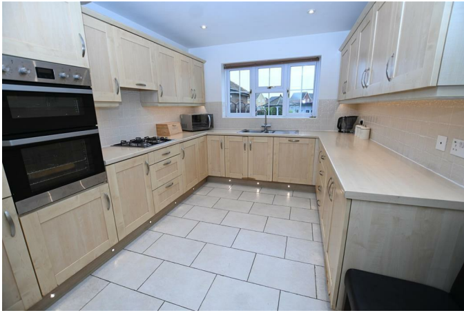
Kitchen 12'5 x 9'6 (3.66m'1.52m x 2.90m)

UPVC double-glazed window overlooking the rear garden, one and a quarter stainless steel sink unit inset to a range of rolled edge work surfaces to three sides with units at base and eye level, stainless steel four-ring gas hob with fitted extractor over and double oven to the side, integrated fridge freezer and dishwasher to remain, radiator, ceramic tiled splash back and tiled floor, flat plastered ceiling with downlighting