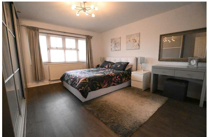
Bedroom One 13'8 x 12'8 (4.17m x 3.86m)

UPVC double-glazed window to the rear, radiator, laminate wood flooring, power points, range of fitted wardrobes to one wall, flat plastered ceiling.