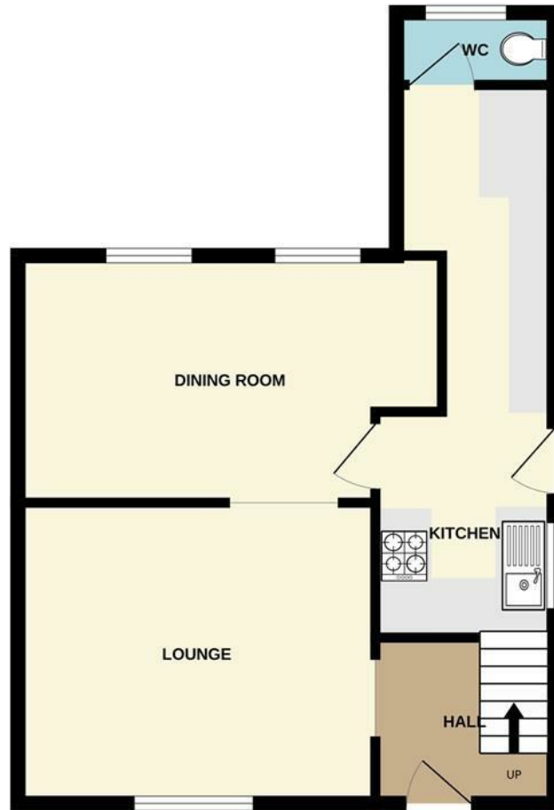
GROUND FLOOR 495 sq.ft. (46.0 sq.m.) approx.