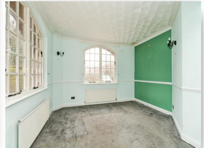
Cottage Number Two, Home Place, Kelling, Holt, NR25 6QS