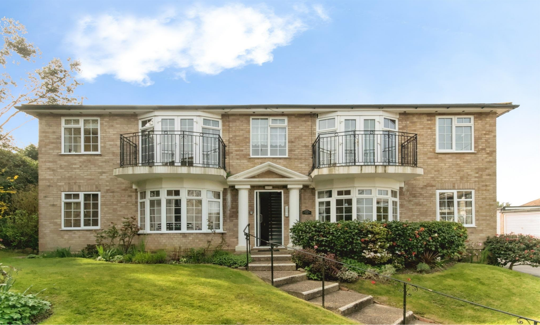
Carnoustie Court - Eridge Close, Bexhill-On-Sea TN39 3QZ