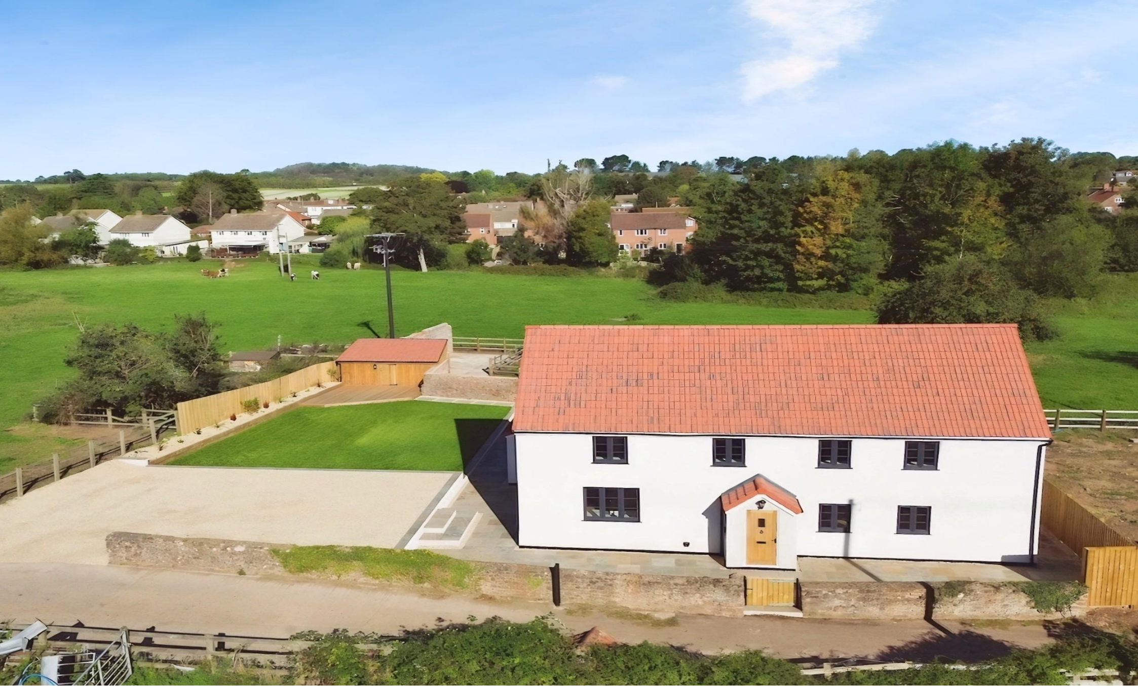
Denmans Farm Denmans Lane, Cannington Bridgwater TA5 2LH