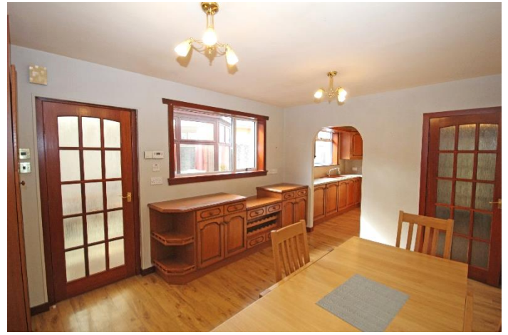
Kitchen 3.13 m x 2.18 m Rear facing window. Fitted with a selection of base and wall units with stone effect countertops and midwall

panelling. Integrated gas hob, electric double oven, extractor hood and fridge. One and a half bowl sink and drainer unit with mixer tap.