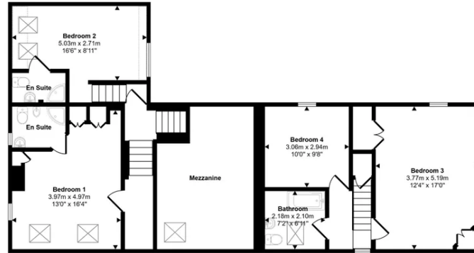
First Floor Approx 87 sq m / 941 sq ft

This floorplan is only for illustrative purposes and is not to scale. Measurements of rooms, doors, windows, and any items are approximate and no responsibility is taken for any error, omission or mis-statement. Icons of items such as bathroom suites are representations only and may not look like the real items. Made with Made Simpley 360.