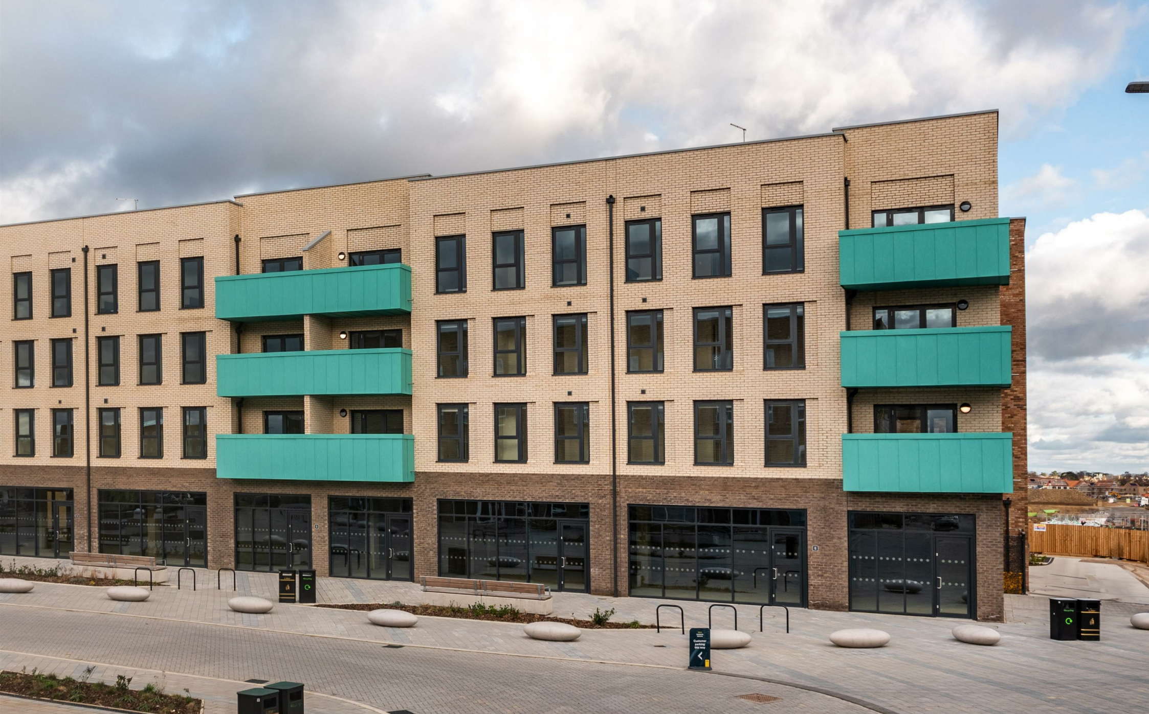
Evolution Court, Cambridge, CB3 0UN