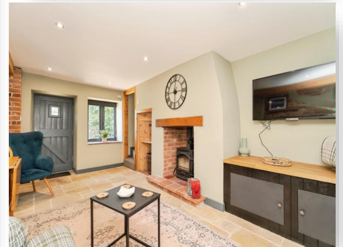
Grove Corner, Roughton Norwich NR11 8QS