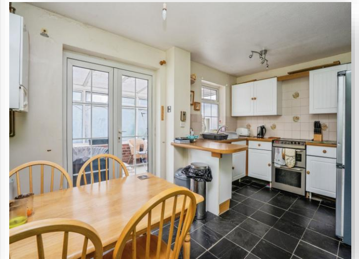
Place Crescent, Waterloooville PO7 5UP