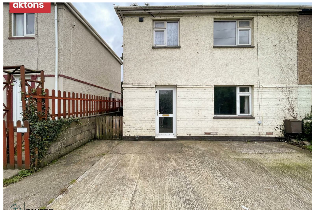
4 Mountain View, Caerphilly, CF83 3HW