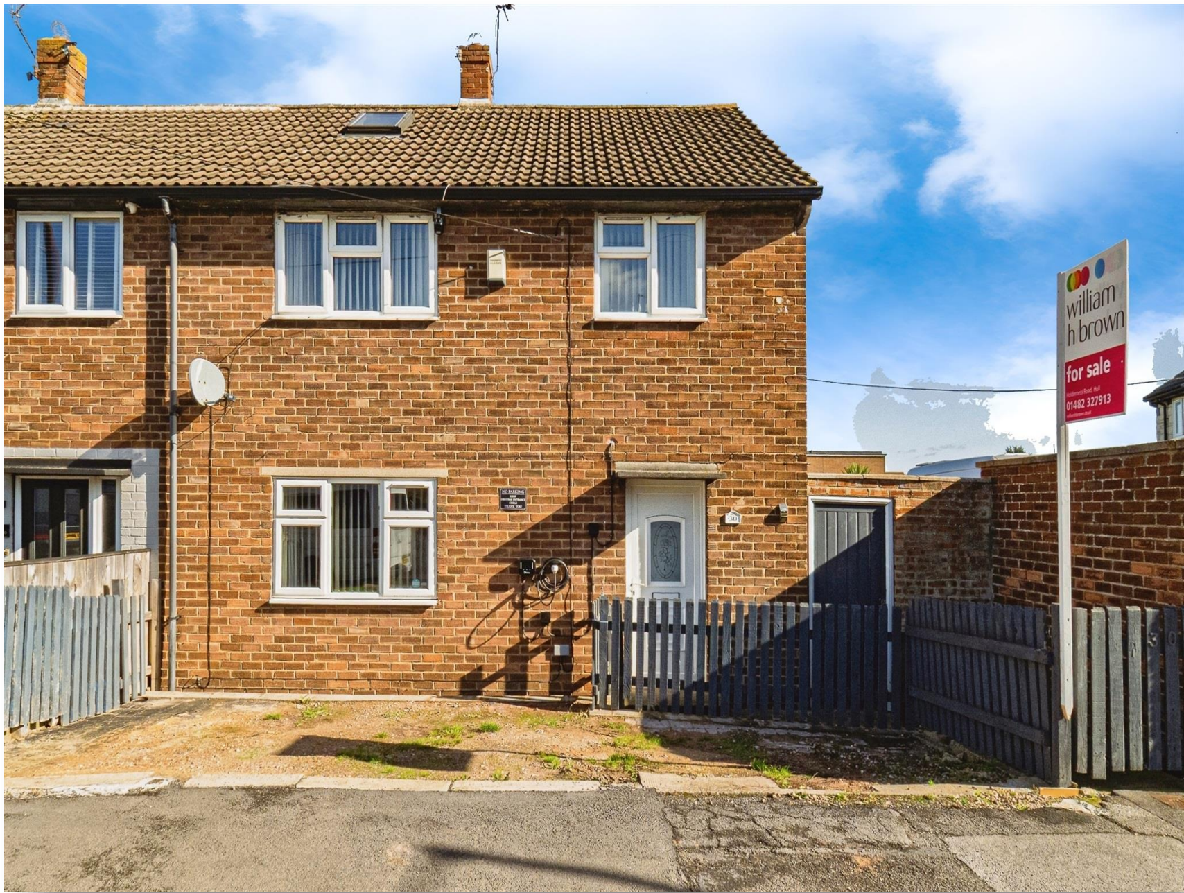
Tamar Grove, Hull, HU8 9SJ