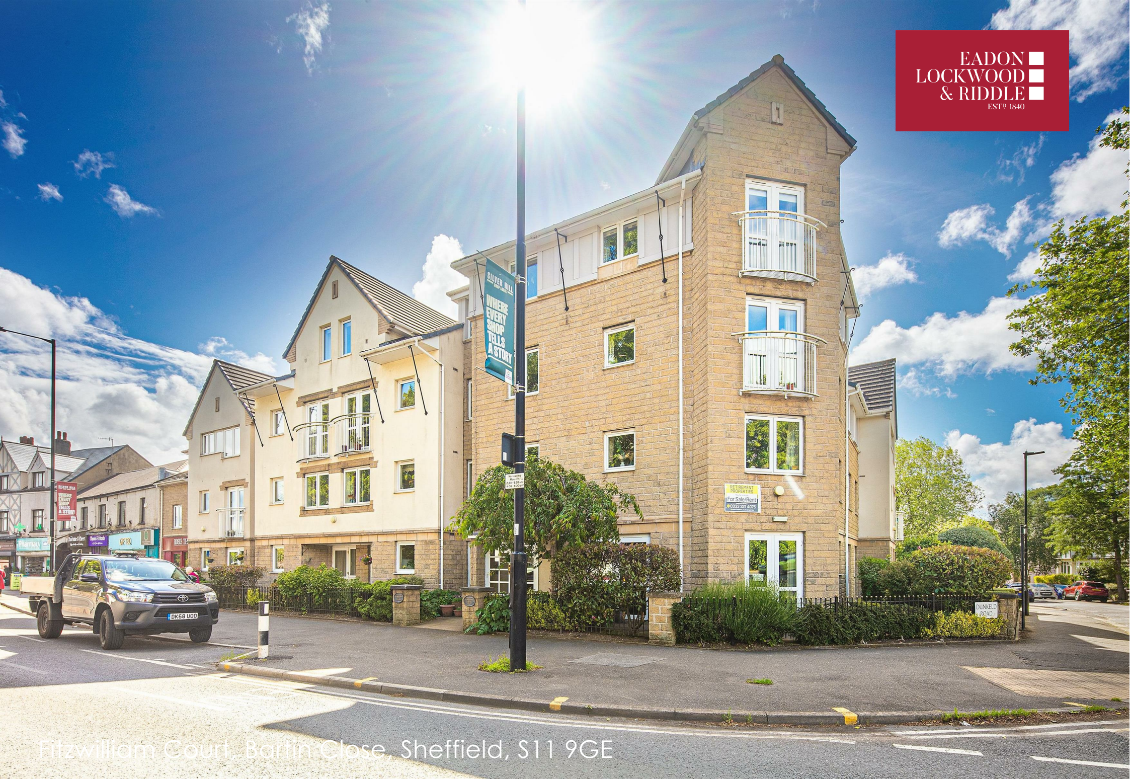
Fitzwilliam Court, Balfour Close, Sheffield, S11 9GE