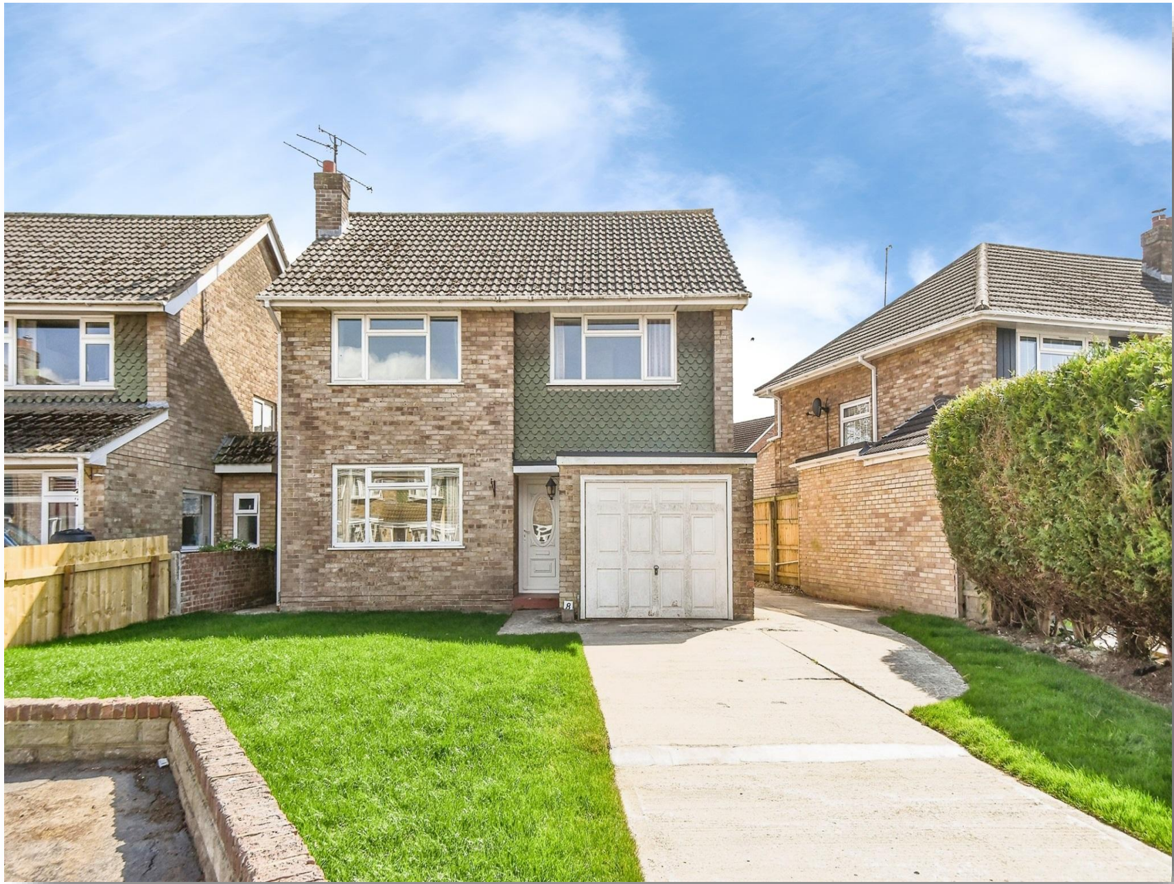
Frankton Gardens, Swindon, SN3 4LU