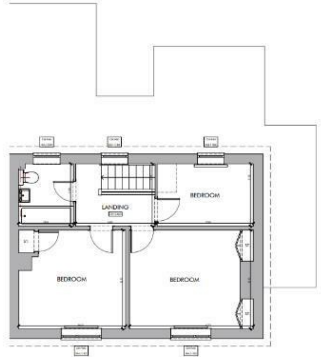
FIRST FLOOR PLAN | AS EXISTING