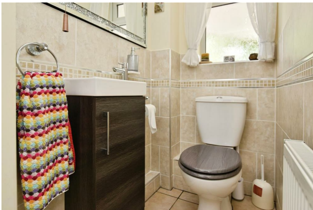
Ground Floor W.C.

Fully tiled ground floor W.C. with low level toilet and wash basin. Radiator and double glazed window.