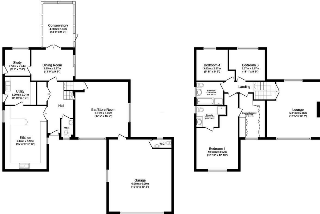
Accommodation Over four levels