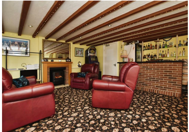
Lower Level Bar, Entertainment Room 17'5" x 16'7" (5.31 x 5.06)

Steps lead down from the ground floor to the basement where you will find a fully equipped bar, ideal for entertaining family & friends. Double glazed window and radiator. Door to garage.