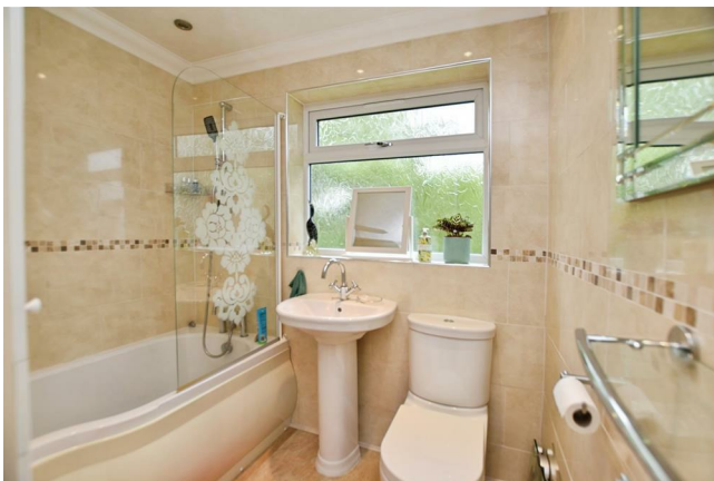
Family Bathroom 8'5" x 7'5" (2.57 x 2.27)

Fully tiled with panelled bath and overhead shower. Pedestal wash basin and low level W.C. Double glazed window and radiator.