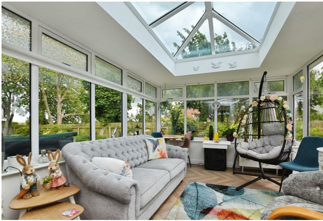
Conservatory 13'9" x 9'3" (4.20 x 2.83)

A lovely addition to the property with double glazed windows to all sides and lantern roof, allowing ample light to flow through whilst enjoying the delights of the surrounding gardens, just lovely to relax and unwind after a long day.