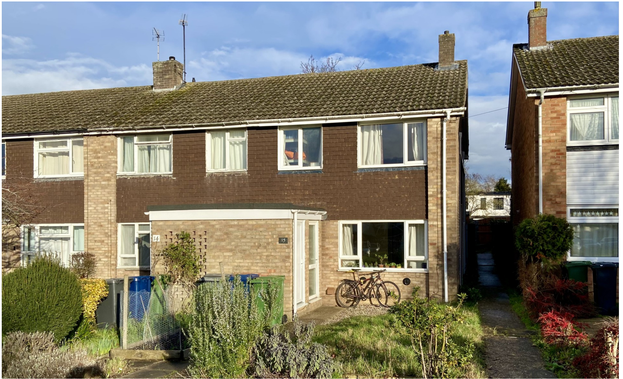
Belmore Close, Cambridge CB4 3NN