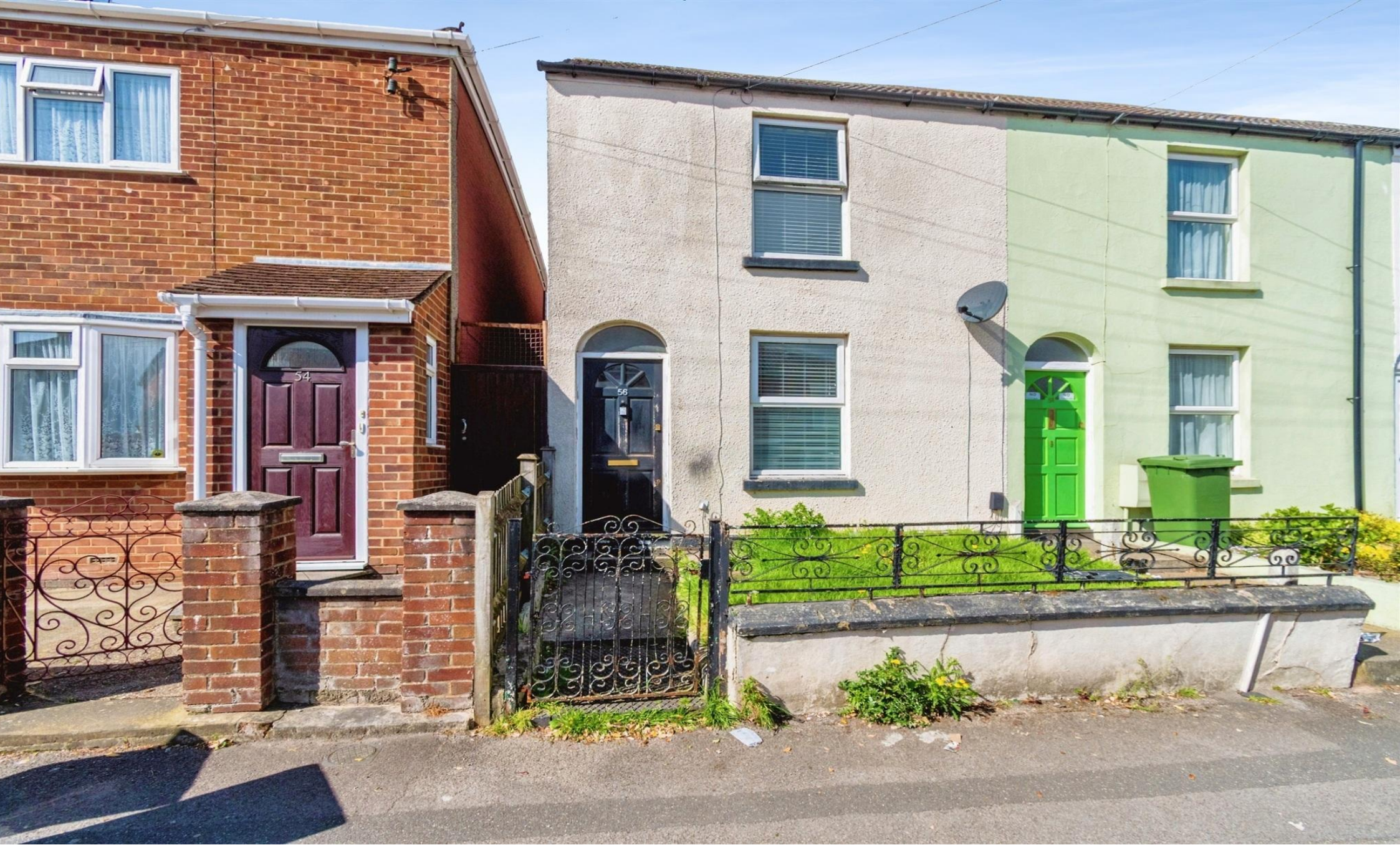
Firgrove Road, Southampton SO15 3EN