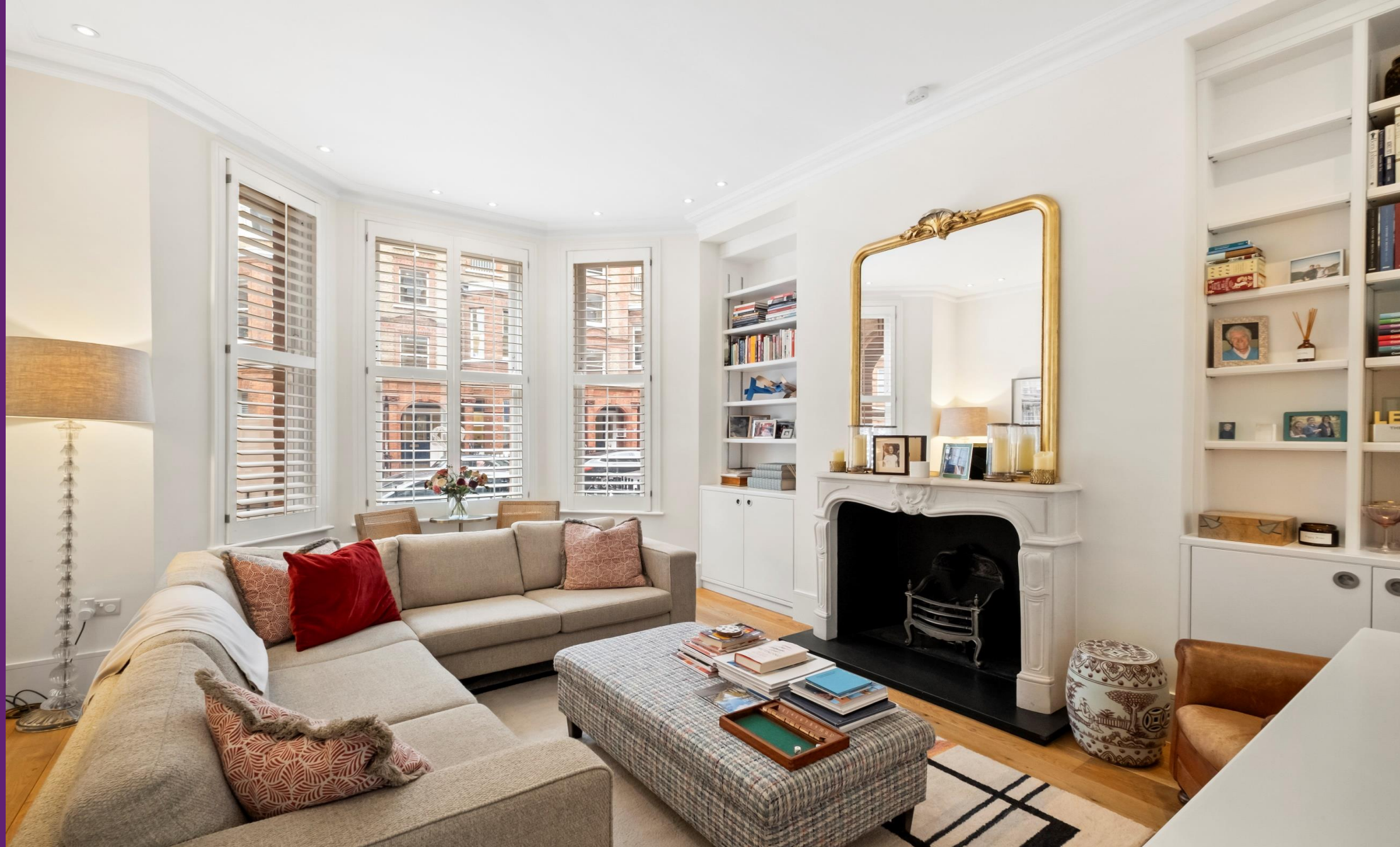
Brechin Place South Kensington, SW7