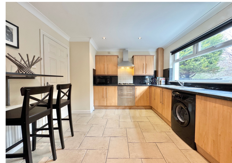
Reform Street, Beith