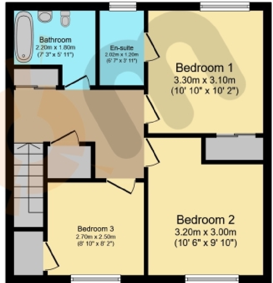
First Floor Floor area 47.6 sq.m. (512 sq.ft.)

Total floor area: 95.1 sq.m. (1,024 sq.ft.)