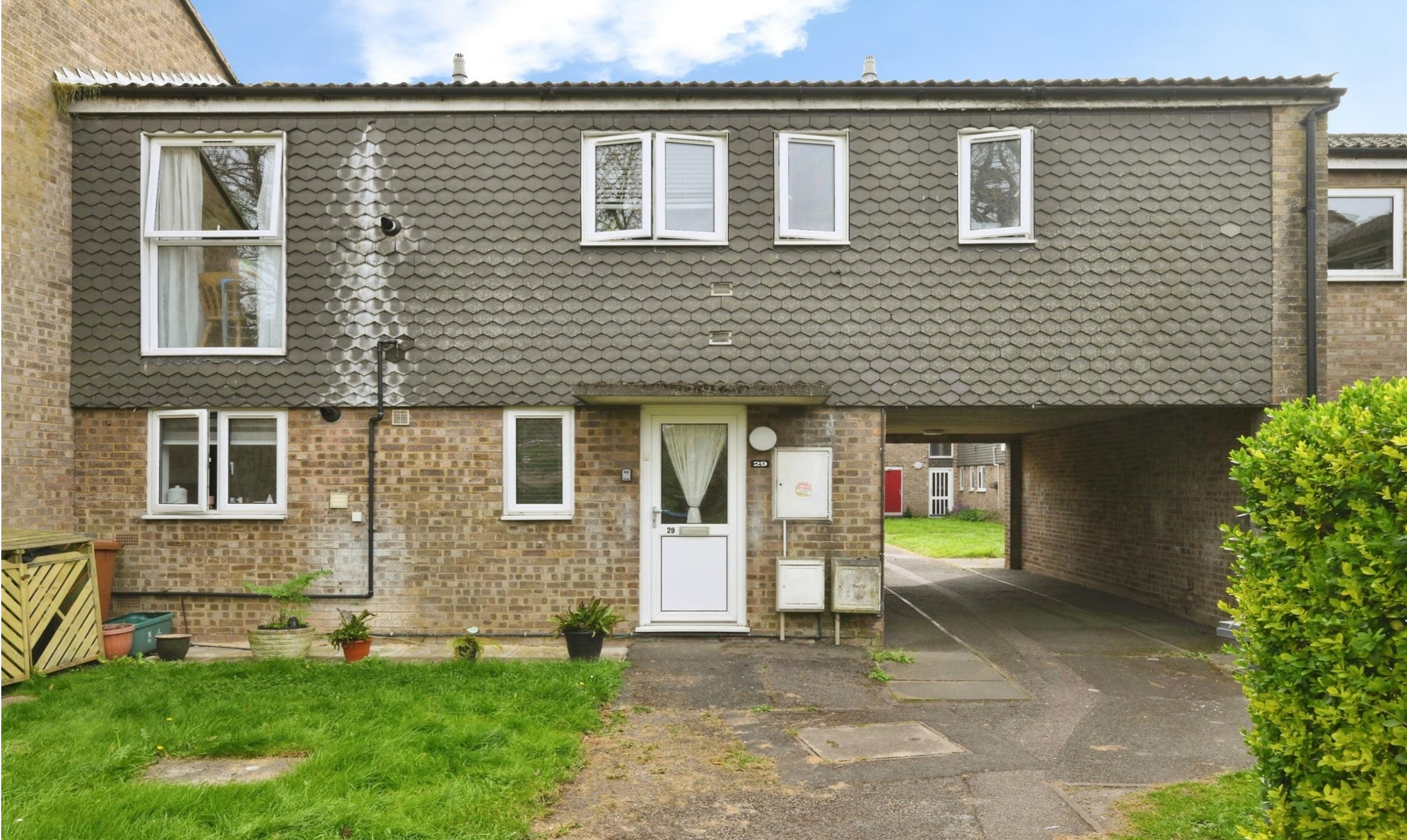
Grove Meadow, Welwyn Garden City AL7 2BE