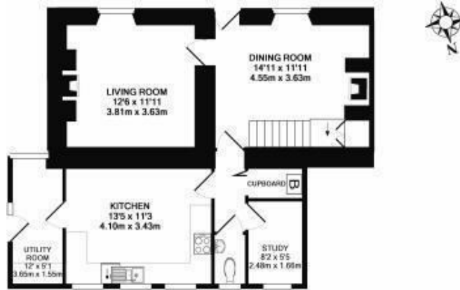
GROUND FLOOR APPROX. FLOOR AREA 854 SQ. FT. (80.8 SQ. M.)