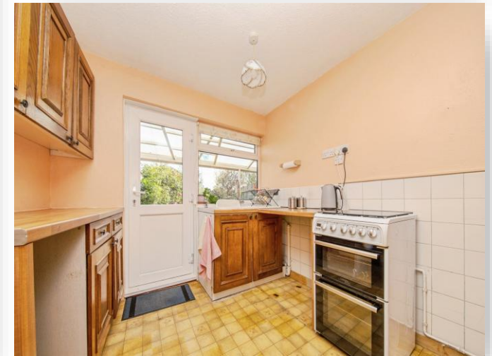
The Street, Bramford, Ipswich, IP8 4EB