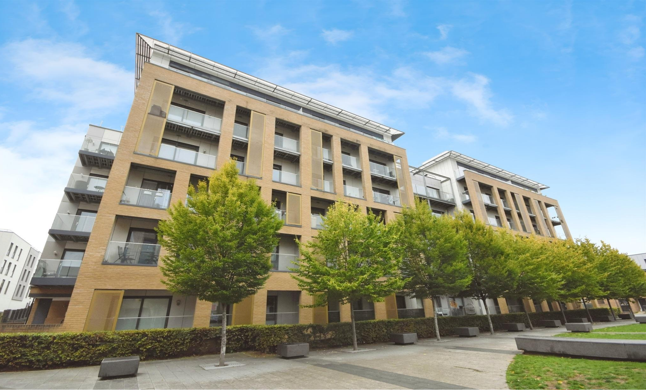
Watson Heights, Chelmsford CM1 1AP