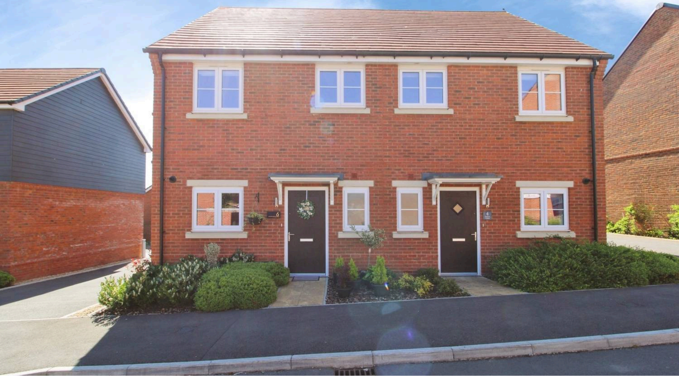
6 Prince Drive Shrivenham