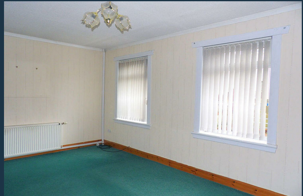
An well designed layout providing an open plan lounge with spacious dining area accessing a bright modern kitchen