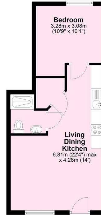
Total area: approx. 36.0 sq. metres (387.4 sq. feet)

Not to scale-for illustrative purposes only. Approximate gross internal floor area. (Excluding stairs and eave storage). All measurements and fixtures including doors and windows are approximate and should be independently verified.