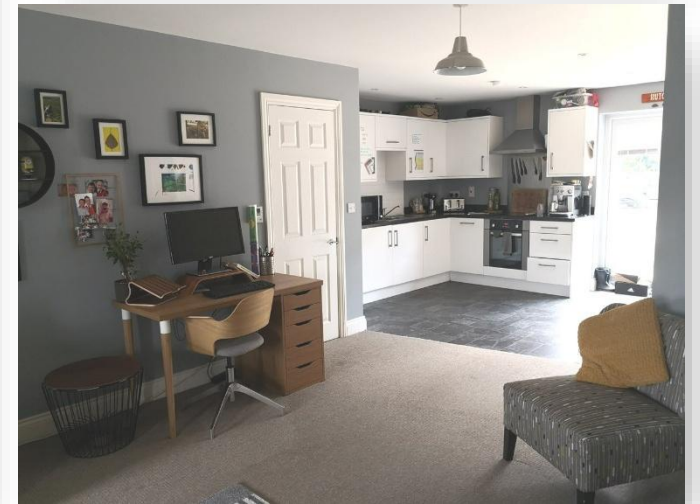
Royal Court, Peterborough PE1 4SD