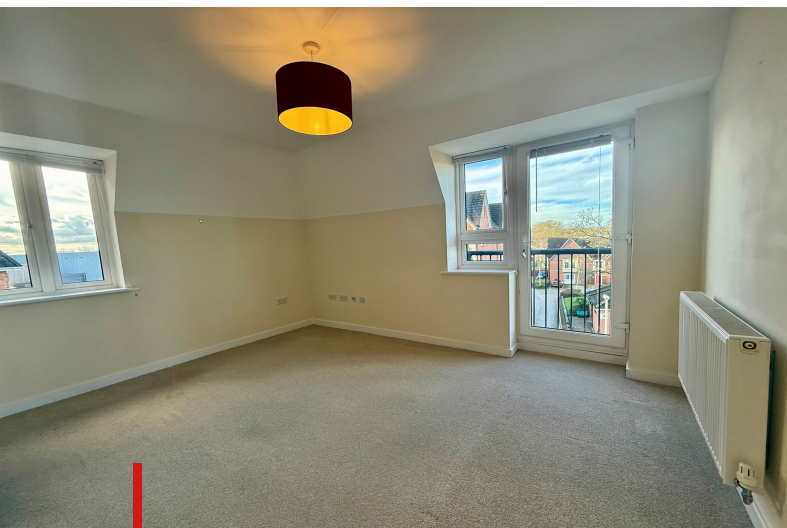
FLAT 21, BROCK COURT VERWOOD Dorset, BH31 7AY