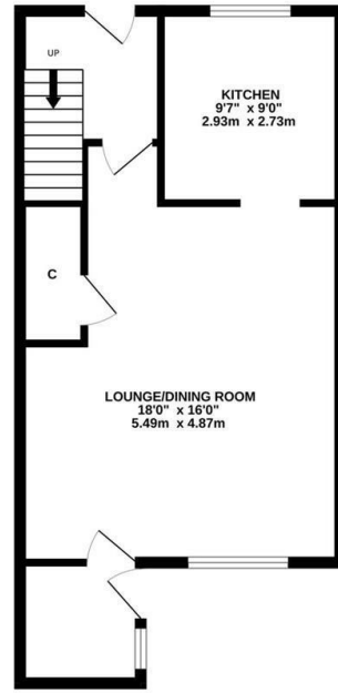
GROUND FLOOR 477 sq.ft. (44.3 sq.m.) approx.