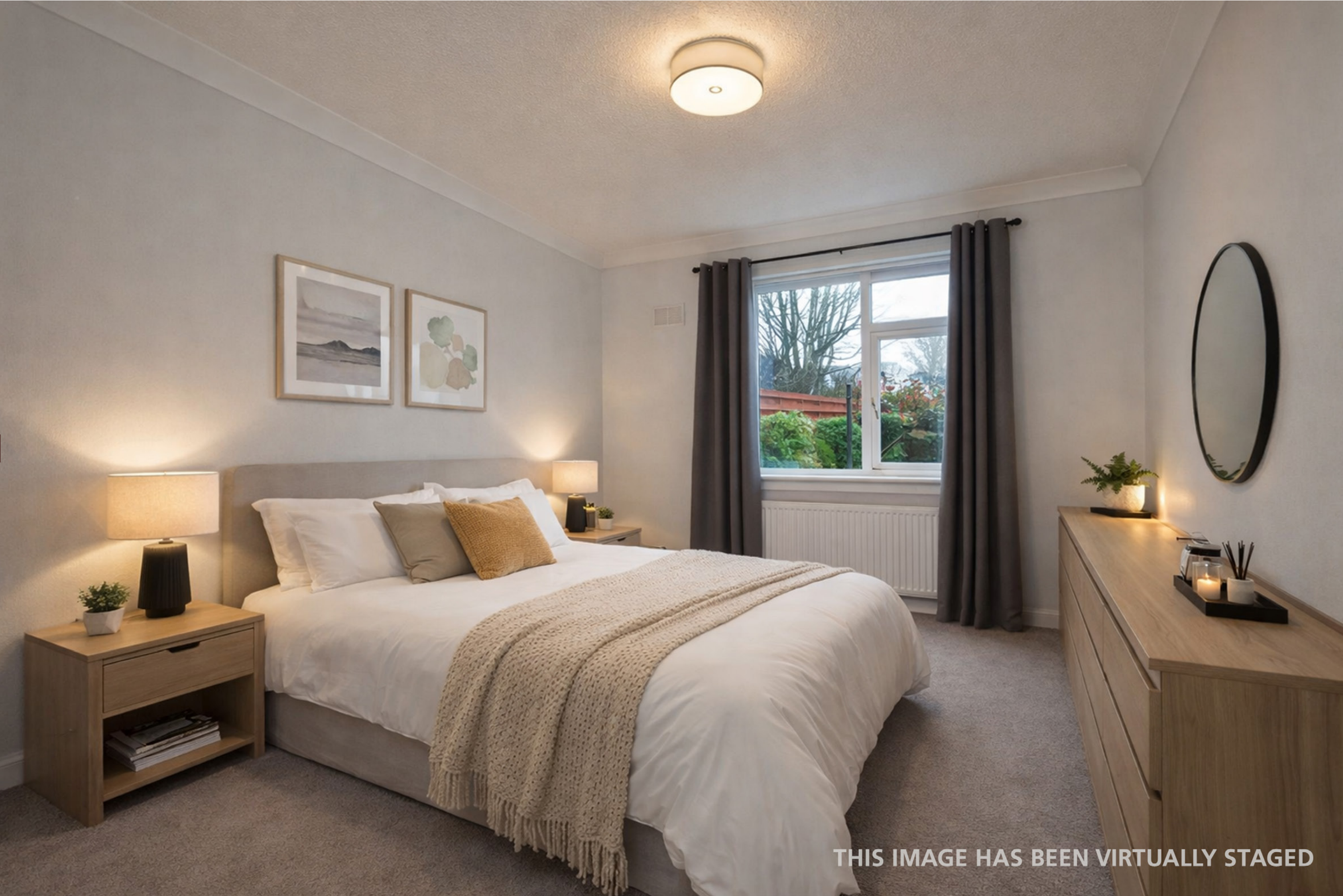
THIS IMAGE HAS BEEN VIRTUALLY STAGED