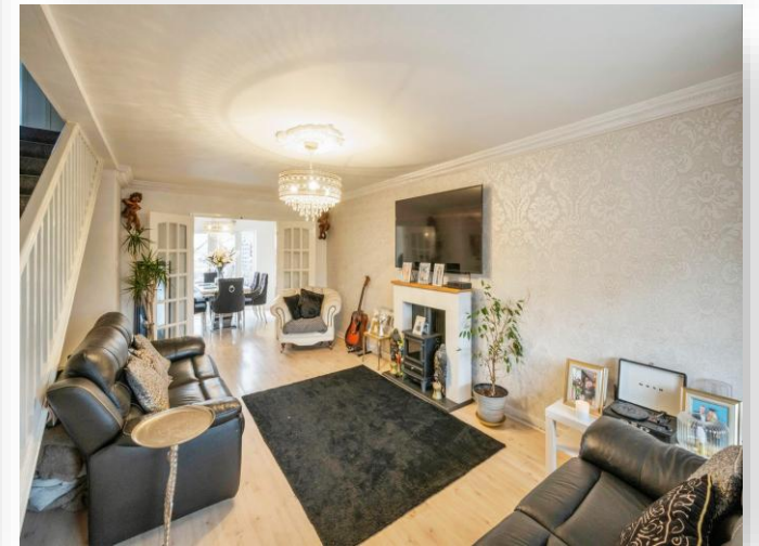
Cliffe House Princess Road, Mexborough S64 0AW