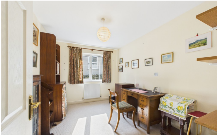
Bedroom Four / Study