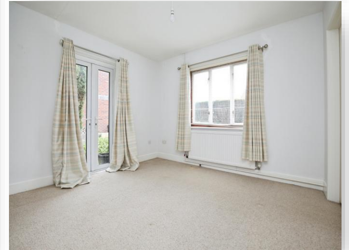
Roseland Avenue, Devizes SN10 3AR