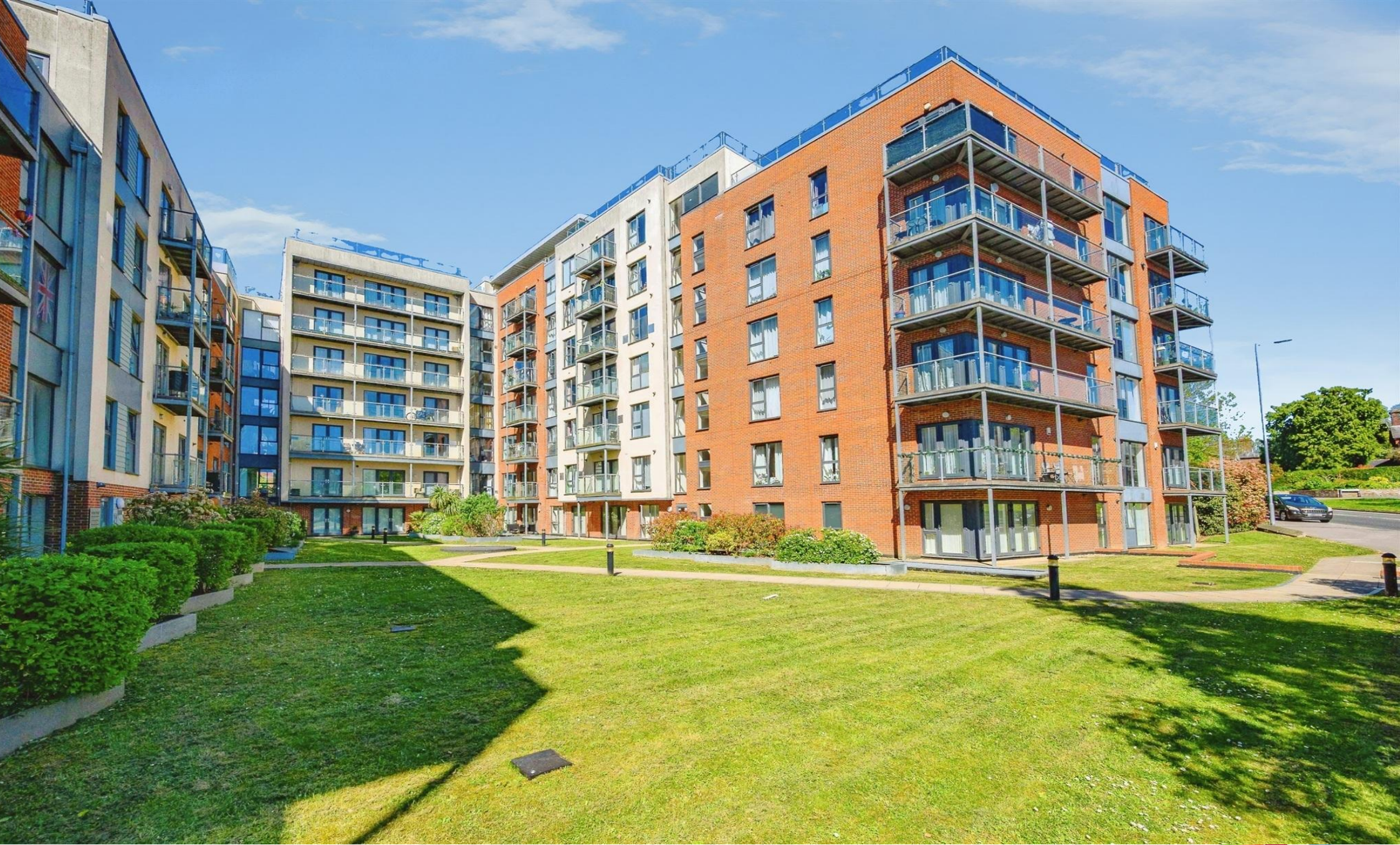
Mosaic House Midland Road, Hemel Hempstead HP2 5YG