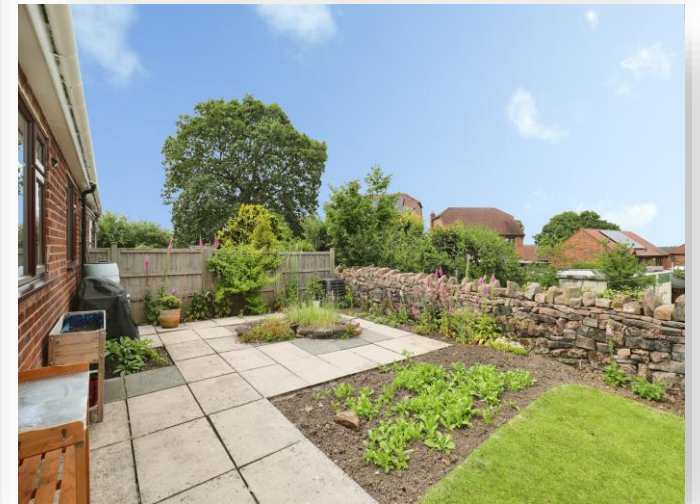
Knox Close, Harrogate HG1 3EG