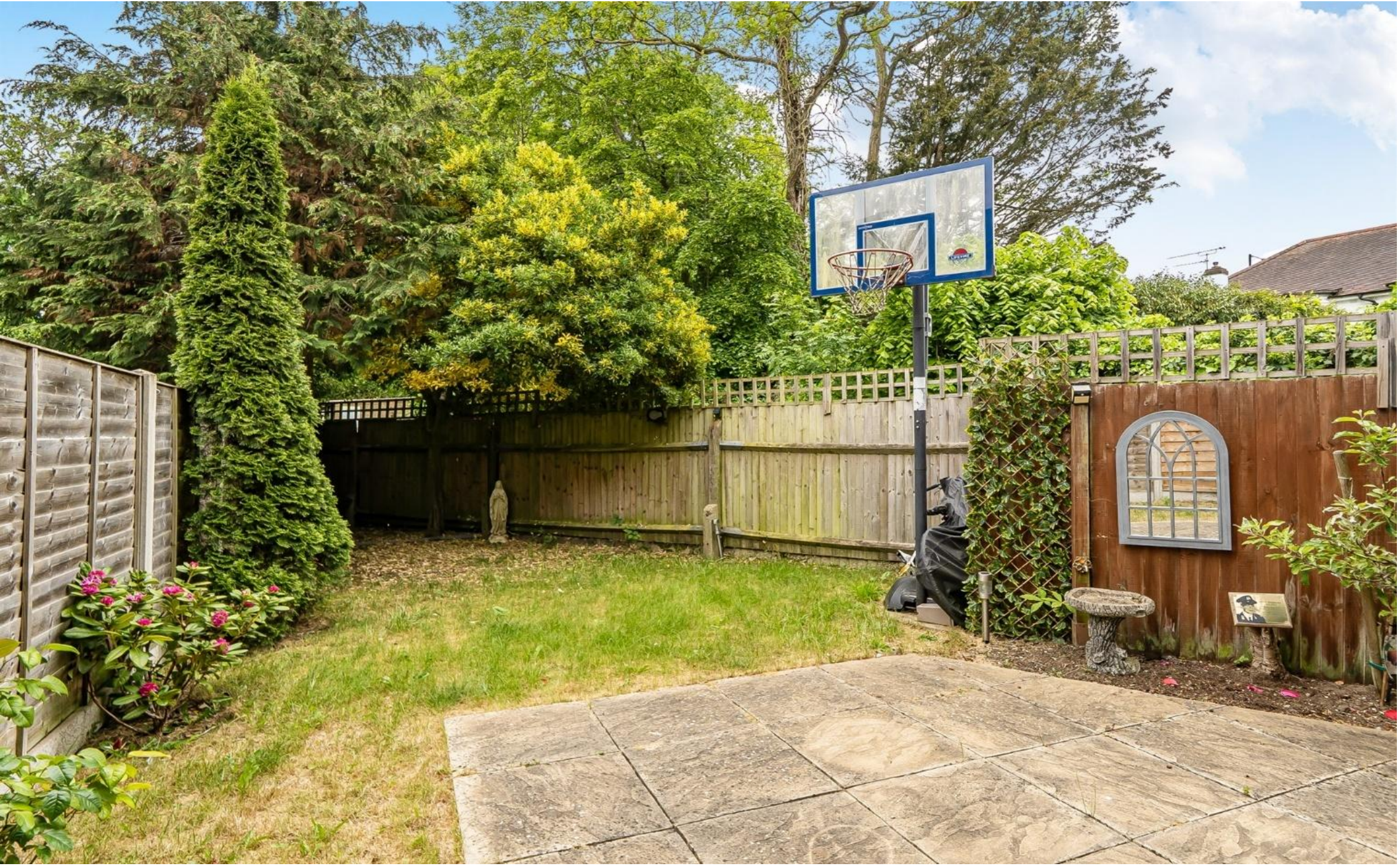
Culloden Road, Enfield EN2 8QE