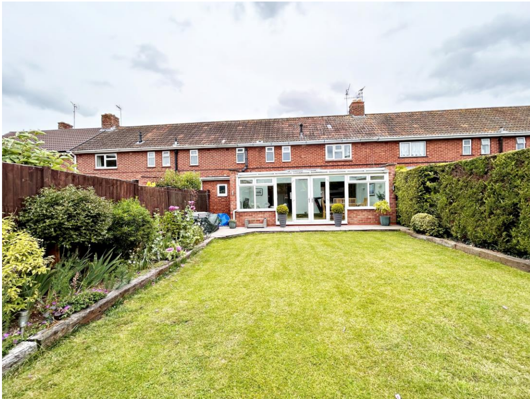
6 Stonewell Terrace, WR10 1LH