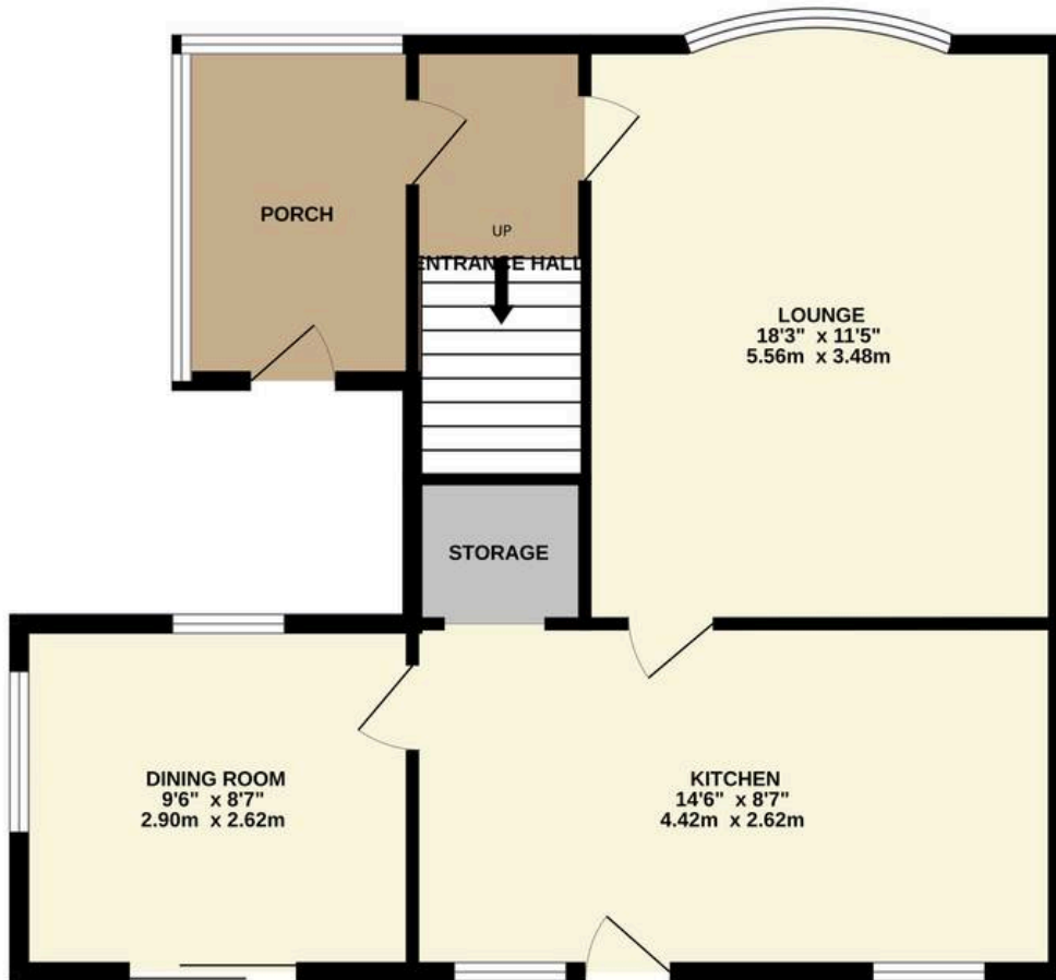
GROUND FLOOR 718 sq.ft. (66.7 sq.m.) approx.