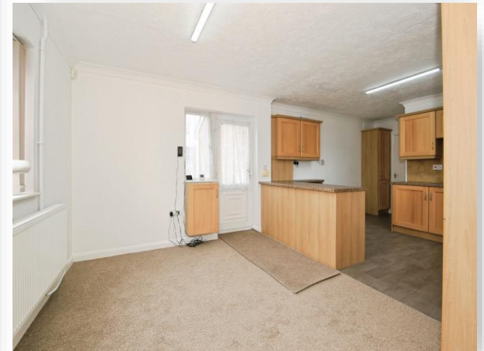
Oakdale Avenue, Peterborough PE2 8TL