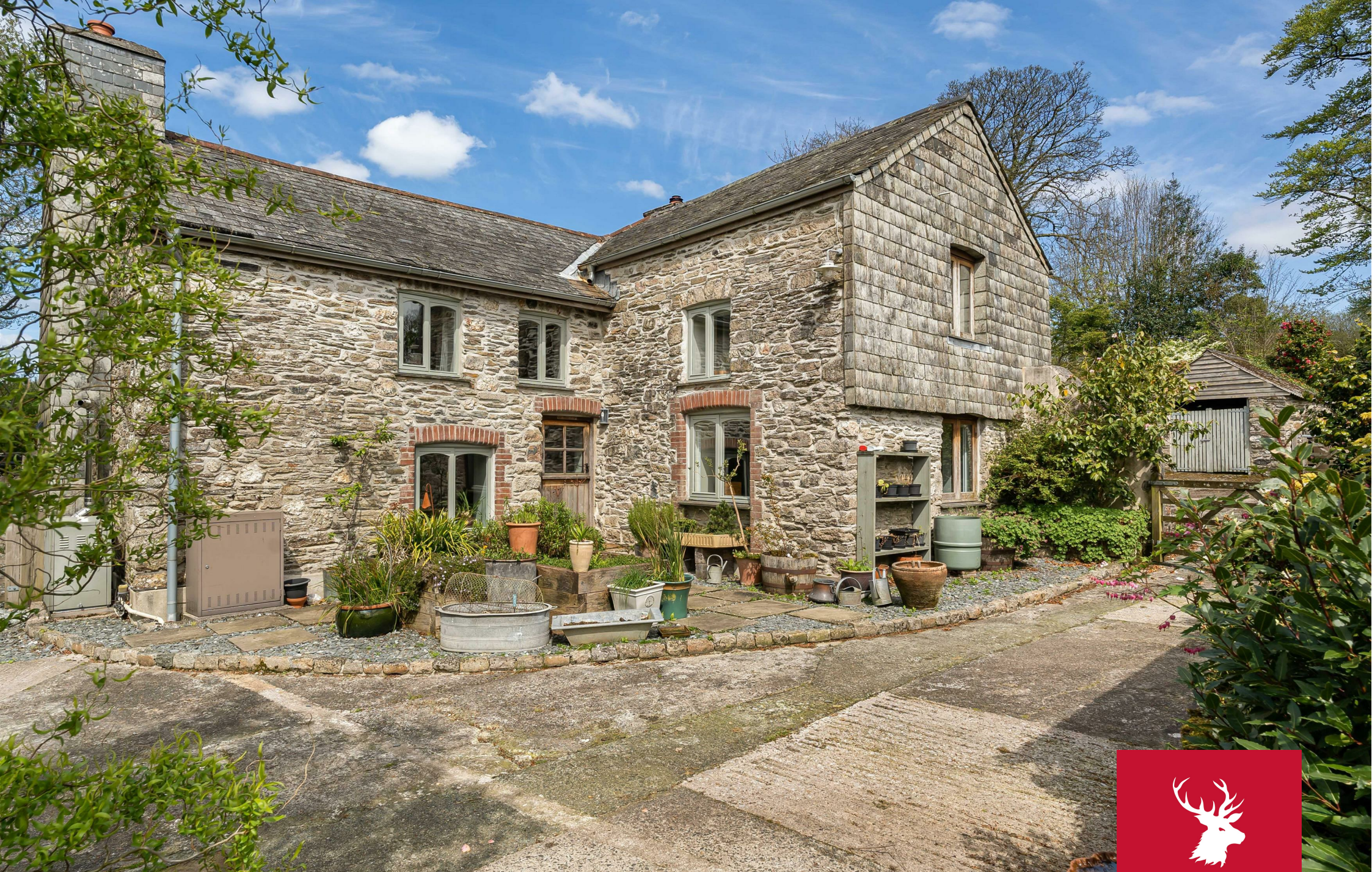
Old Venn Farm