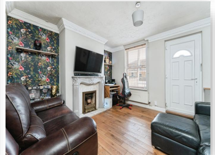
Wisbech Road, March PE15 8EB