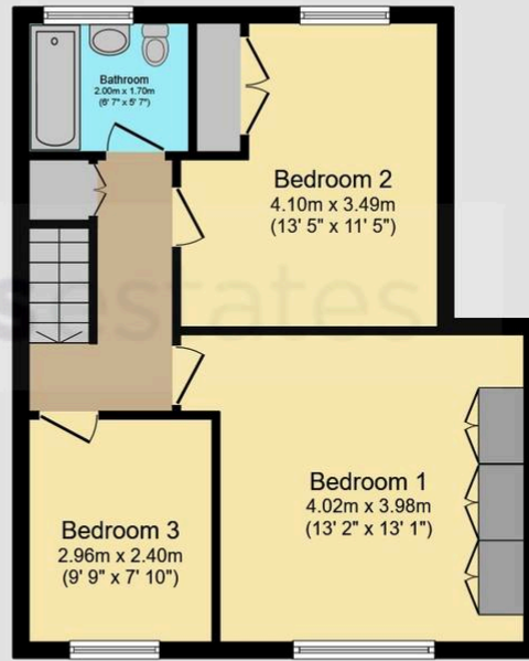
First Floor Floor area 48.7 sq.m. (524 sq.ft.)

Total floor area: 96.3 sq.m. (1,037 sq.ft.)