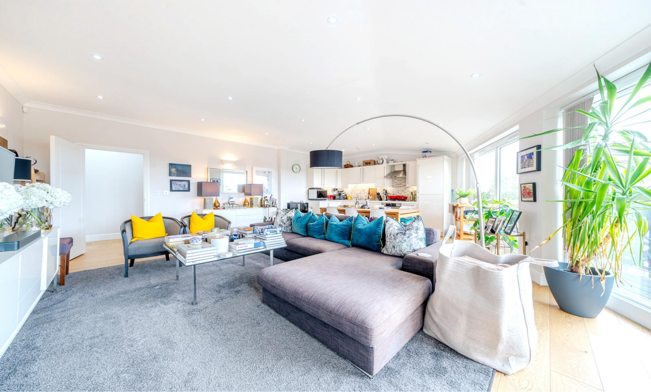
Saren House, Cambridge Road, London, W7 3DU