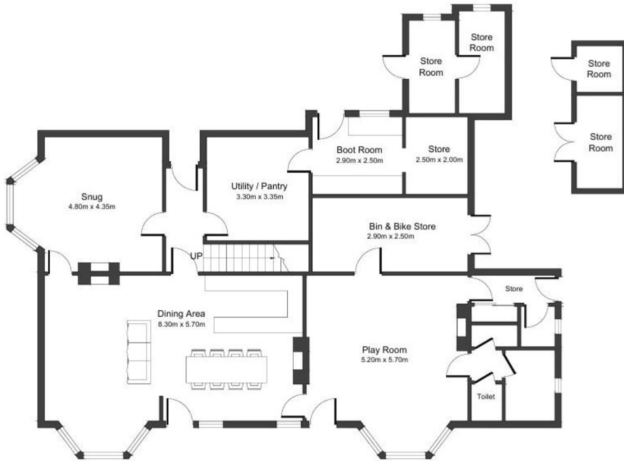
PROPOSED GROUND FLOOR