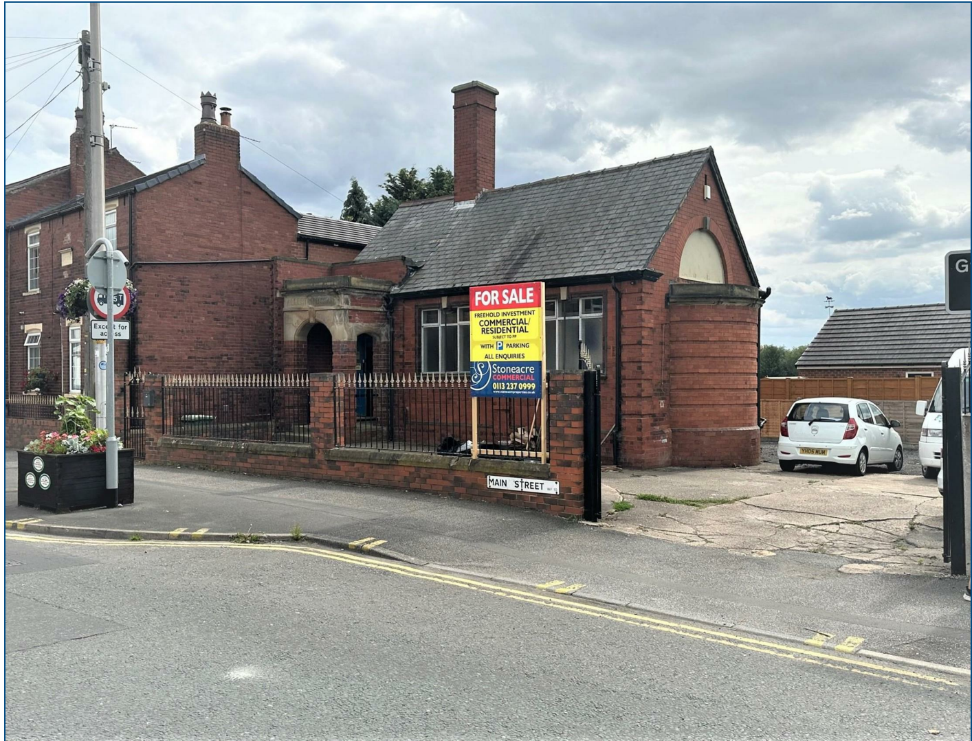
2, Main Street, Allerton Bywater, WF10 2DL