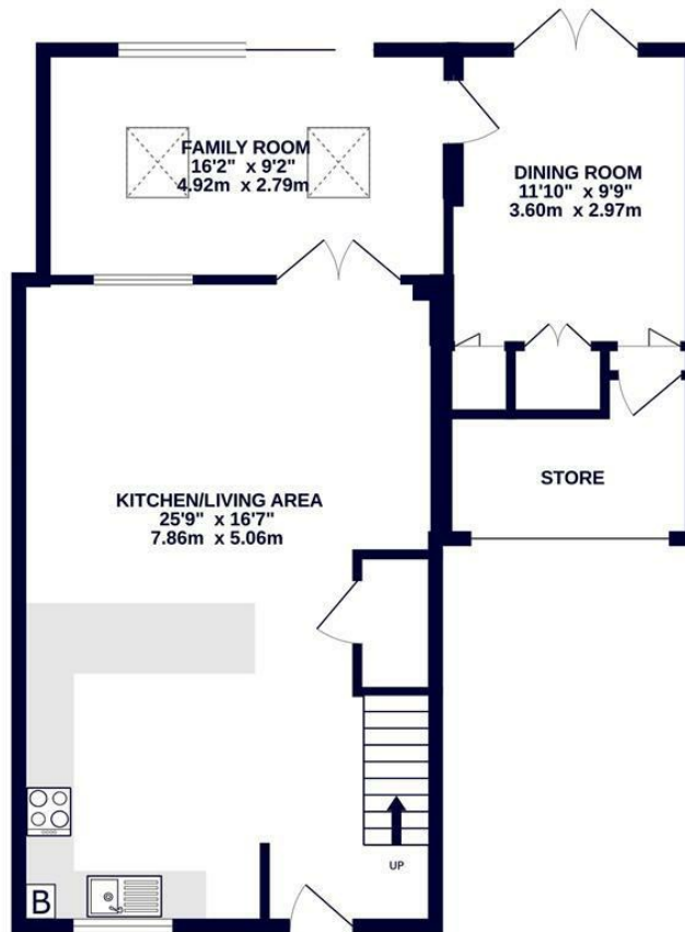
GROUND FLOOR 760 sq.ft. (70.6 sq.m.) approx.