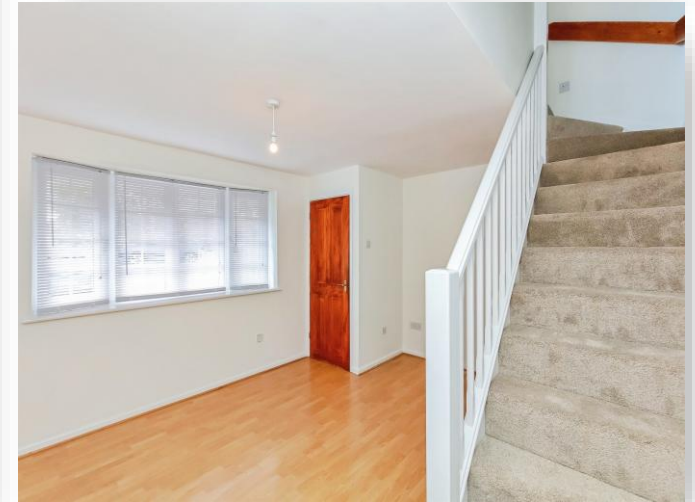
Thirlmere Close, Kettering NN16 8LY