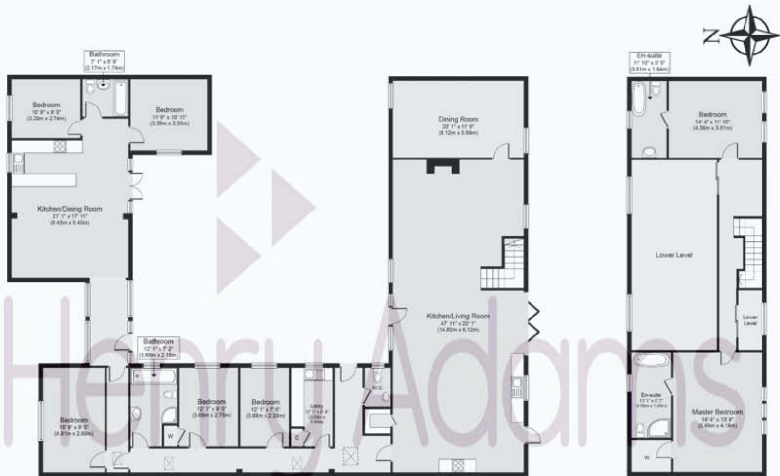
Ground Floor Approximate Floor Area 2,820 sq. ft. (262.0 sq. m.)