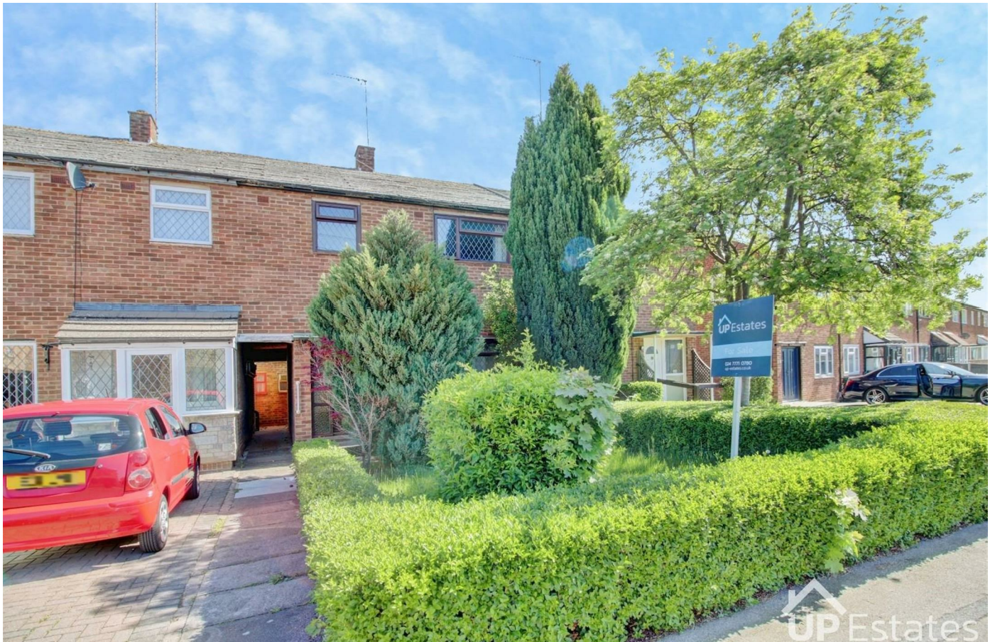
Arundel Road, Coventry